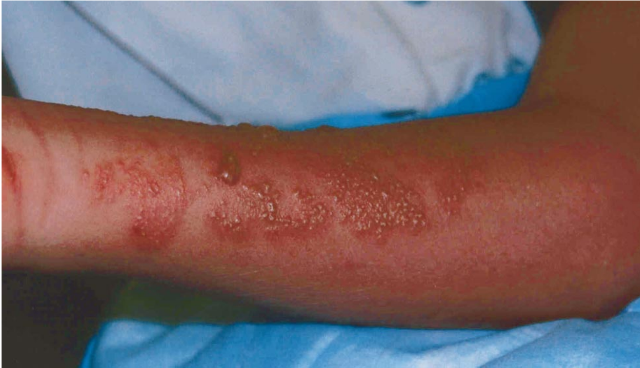
Figure 2. Thirteen-year-old surfer a day after a sting from a Chiropsalmus quadrumanus jellyfish.

sive protection for recreational and professional swimmers, a repellent cream was formulated. This repellent cream was compounded into a waterproof sunscreen containing octyl methoxycinnamate and zinc oxide, which would allow for single-application protection from both sting and sunburn.