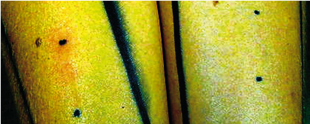
Figure 5. Erythema is notable on the arm treated with the placebo lotion and absent on the arm treated with the inhibitor lotion after exposure to a jellyfish tentacle.

onstrate efficacy in an underwater setting and after open-water contact with jellyfish. Additionally, whereas this inhibitor is formulated in a waterproof sunscreen, future research will be required to quantify the duration of protection afforded by the application of the inhibitor in an underwater setting.