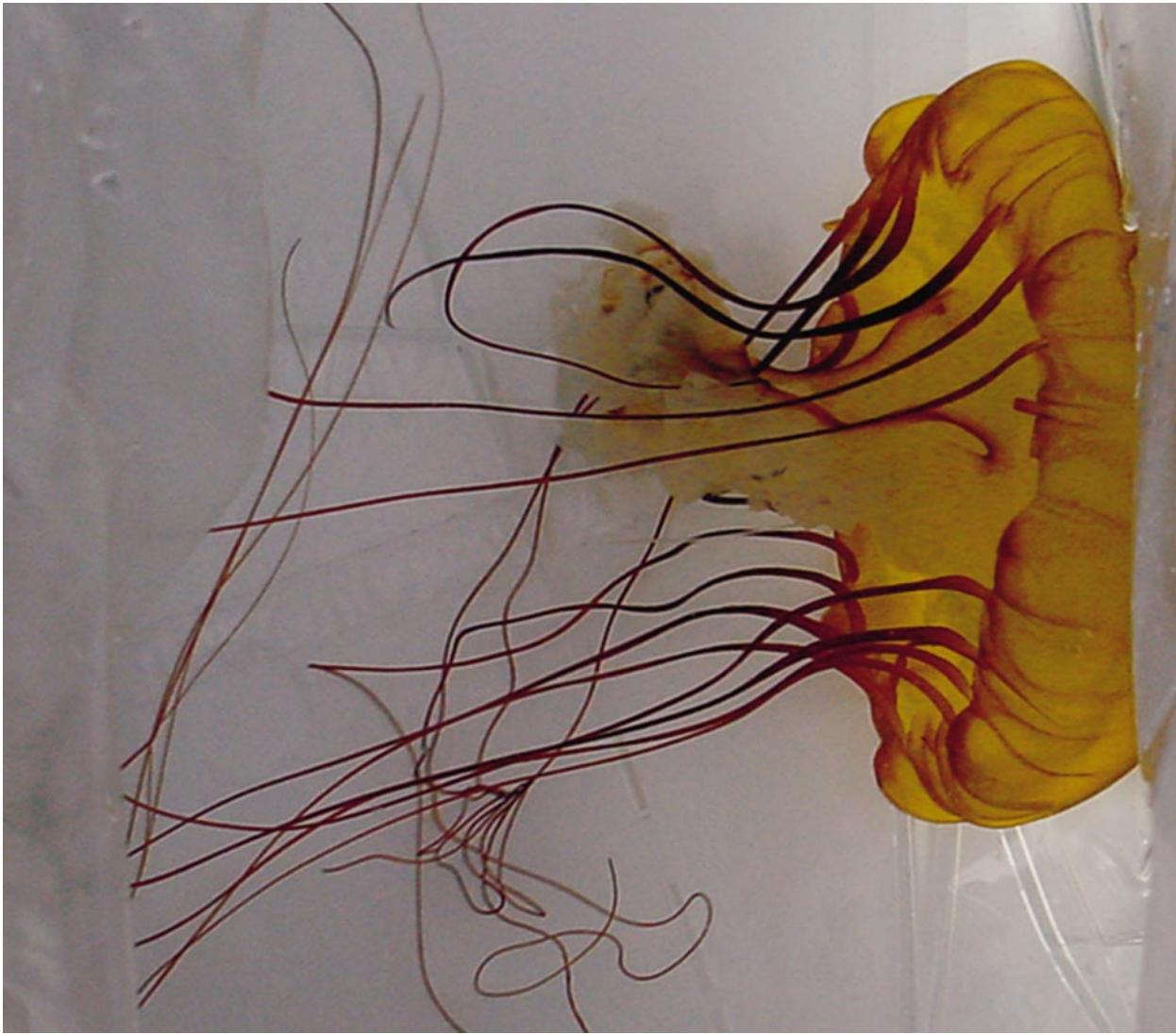
Figure 1. Chrysaora fuscescens jellyfish.

to be dangerous to humans and may be of special danger, even life-threatening, to small children. 7,8 It is prevalent in certain ocean waters of the United States, primarily in the Gulf of Mexico area and along the coastlines of Florida and Texas.